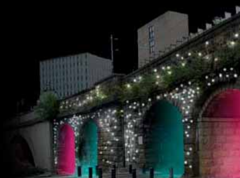
Image: lit railway arches

Glow will culminate on New Year's Eve with MOBILE, a fantastic dance event and fireworks display for all the family. See page 22 in the main guide for details.